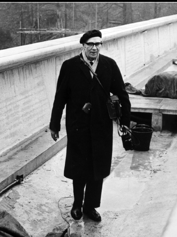
Sir Ove Arup, Kingsgate Footbridge, Durham

Following on from this success the Foundation has committed to a second programme which is planned to give a further 300 students experiences in careers in engineering.