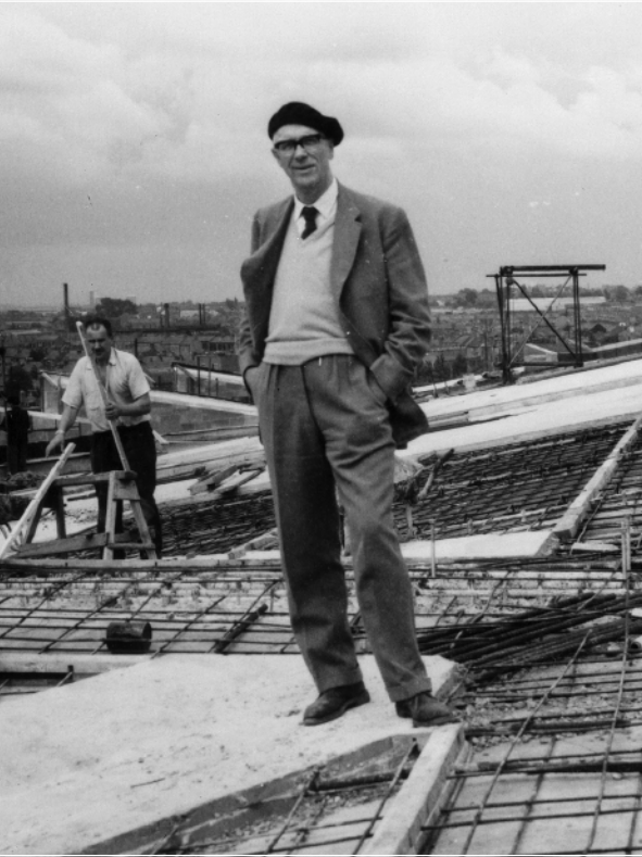
Sir Ove Arup, Coventry Cathedral